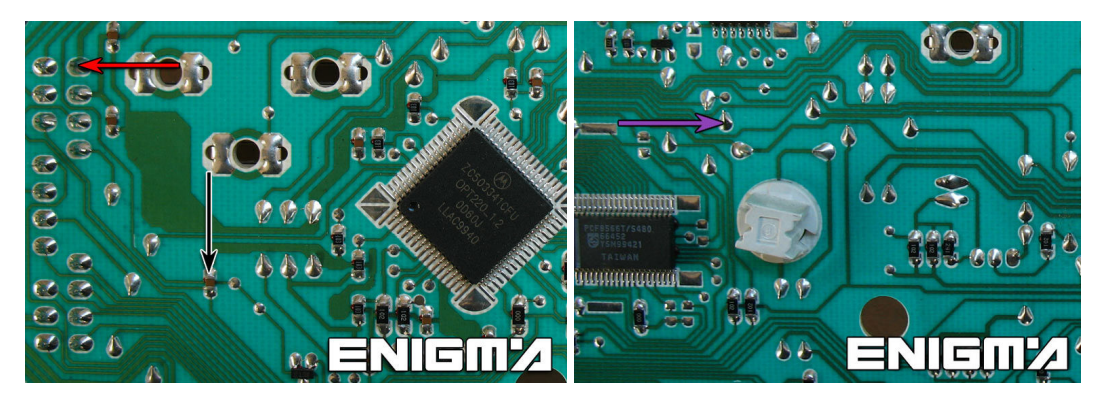
PHOTO 1: Solder cables according to the colors like shown on the photos above.