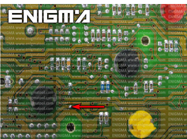
PHOTO 2: Solder cables according to the colors like shown on the photos above.