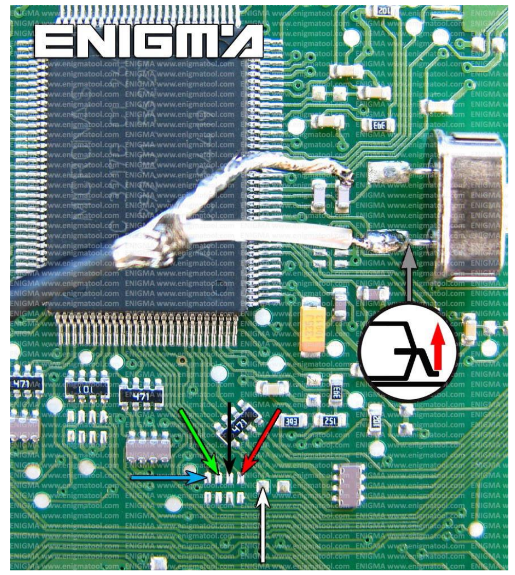
PHOTO 3: Connect blue, white, green, black, red wire from C44, lift up marked pin from crystal resonator and solder coax cable like on photo above. White wire from coax cable must be connected to PCB.