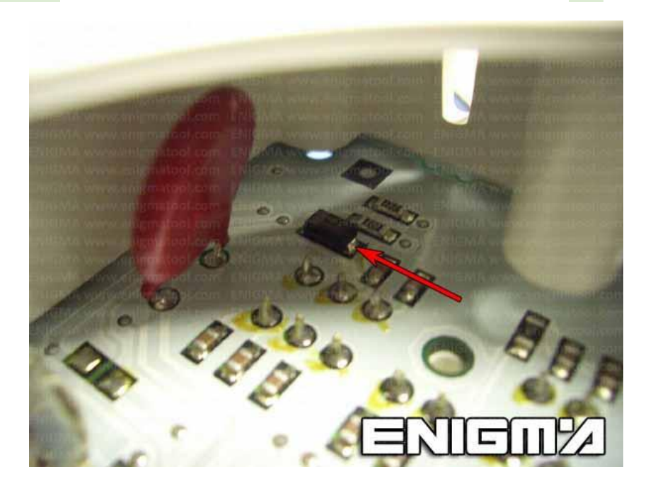
PHOTO 2: Solder C11 cables according to the colors like shown on the photo above.