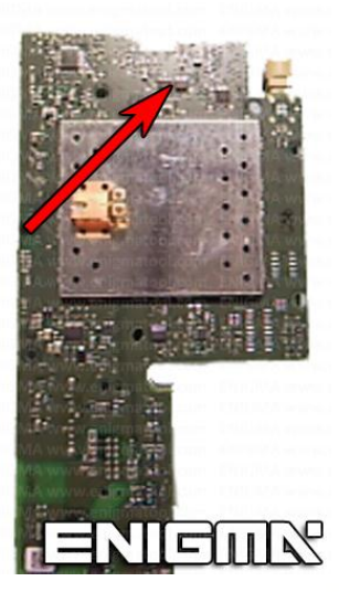
PHOTO 1: Connect cable C4 to the EEPROM memory according to the picture above.