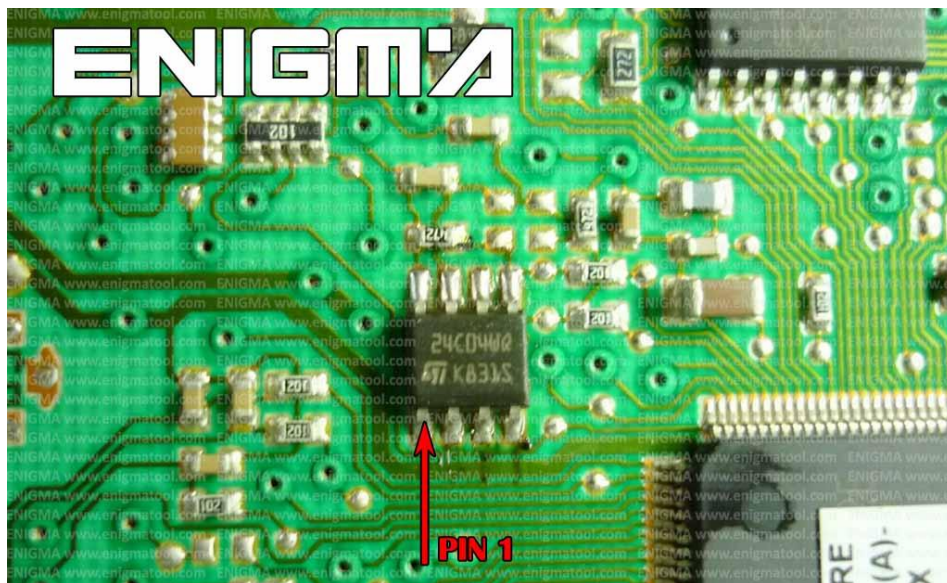
PHOTO 1: Connect cable C4 to the EEPROM memory according to the picture above.