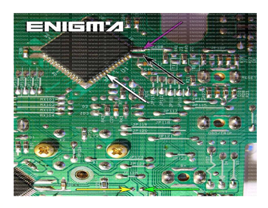
PHOTO 1: Solder C11 cables according to the colors like shown on the photo above.