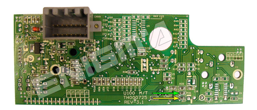
PHOTO 2: Solder C11 cables according to the colors like shown on the photo above.