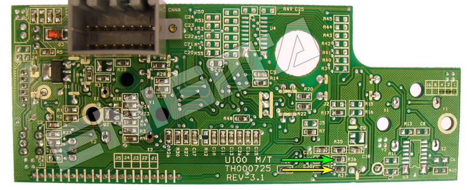
PHOTO 2: Solder C11 cables according to the colors like shown on the photo above.