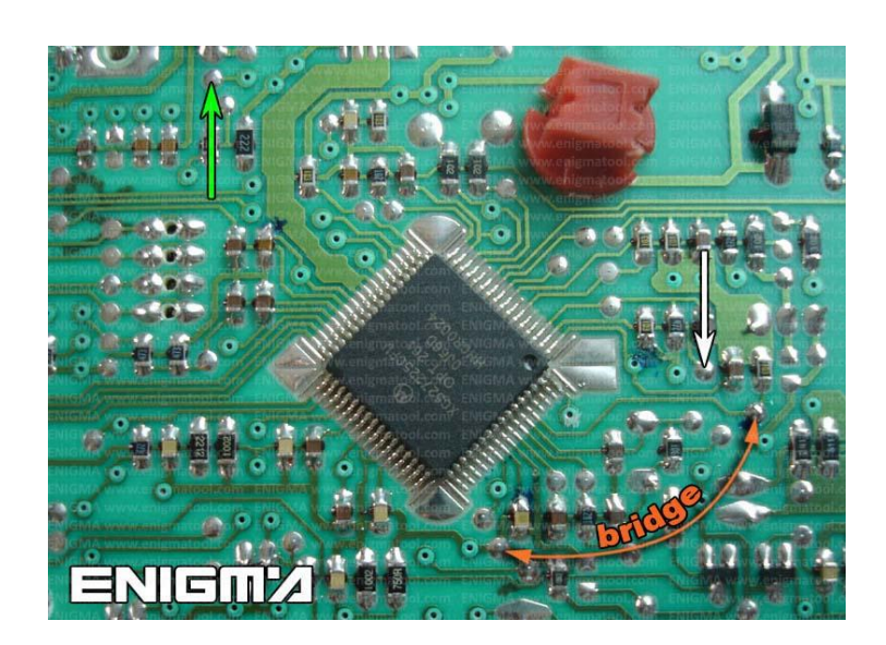
PHOTO 1: Solder C12 cables according to the colors like shown on the photos above.