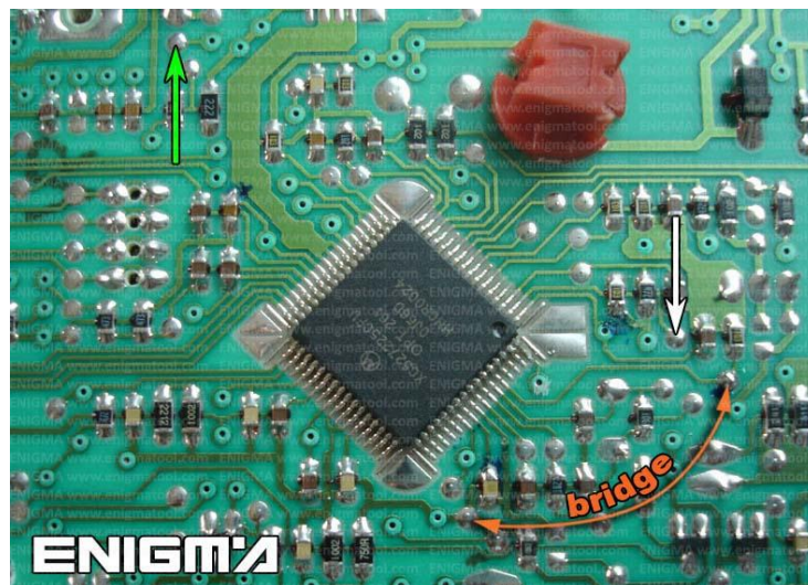
PHOTO 1: Solder C12 cables according to the colors like shown on the photos above.