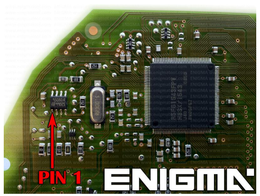
PHOTO 2: Connect cable C4 to the EEPROM memory according to the picture above.