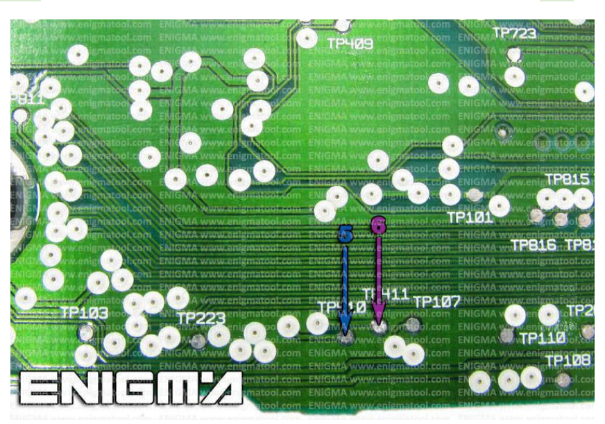
PHOTO 2: Solder cable C7 according to the colors like shown on the photo above.