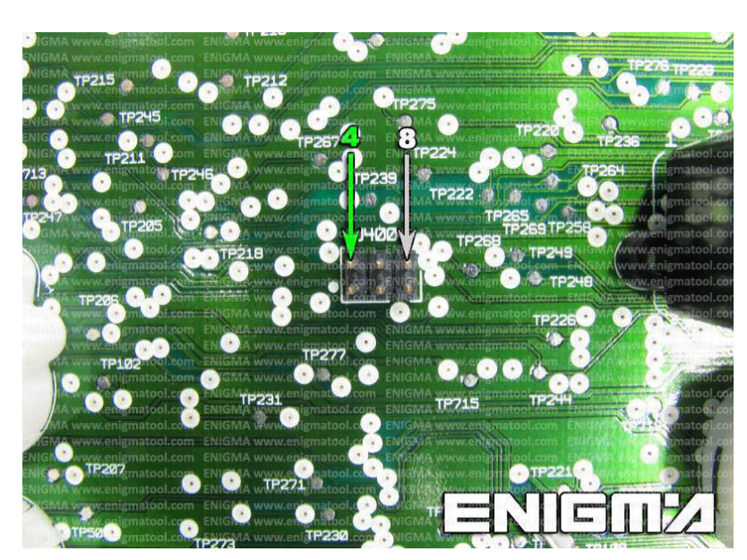
PHOTO 1: Solder cable C7 according to the colors like shown on the photo above.