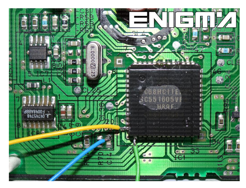
PHOTO 1: Solder C11 cables according to the colors like shown on the photo above.