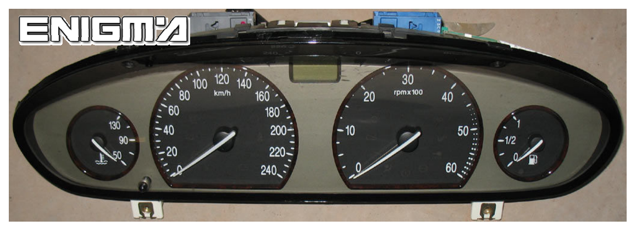
USE CABLE C11, REMOVE BACK PLASTIC COVER FROM DASH AND CHECKING DIFFERENT VERSIONS OF BOARD: