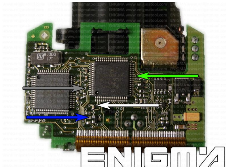
PHOTO 1: Solder C12 cables according to the colors like shown on the photo above.

! IF READING IS CORRECT BUT CHANGE IS NOT POSSIBLE YOU HAVE TO SOLDER 10K OR 15K RESISTOR TO THE GREY CABLE AND TRY AGAIN !