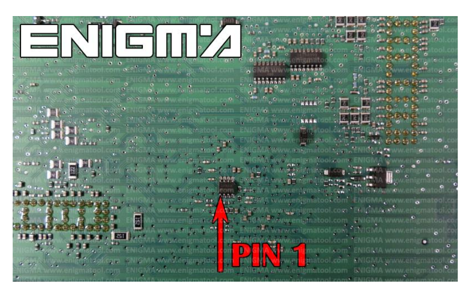
PHOTO 1: Connect cable C4 to the EEPROM memory according to the picture above.