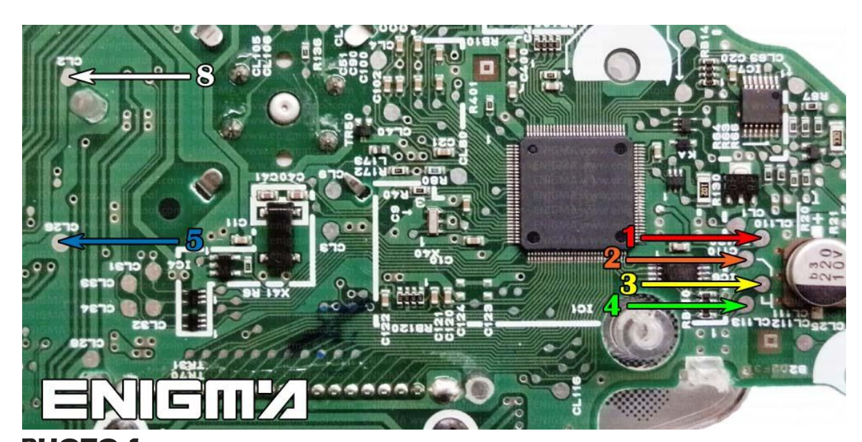
PHOTO 1: Connect cable C7 to the points as shown on the picture above.