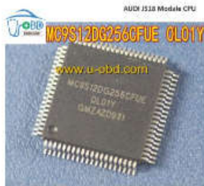
MC9S12DG256CFUE OL01Y Audi A6 J518 module vulnerable CPU