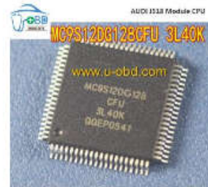
MC9S12DG128CFU 3L40K Audi A6 J518 module vulnerable CPU

Read both the flash and eeprom dump from the MCU and saved on desktop, the XPROG wiring diagram: