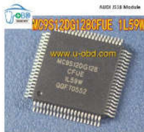
MC9S12DG128CFUE 1L59W Audi A6 J518 module vulnerable CPU