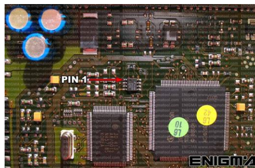
PHOTO 1: Connect cable C4 to the EEPROM memory according to the picture above.