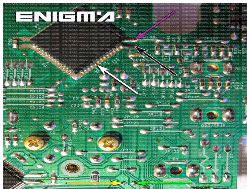
PHOTO 1: Solder C11 cables according to the colors like shown on the photo above.