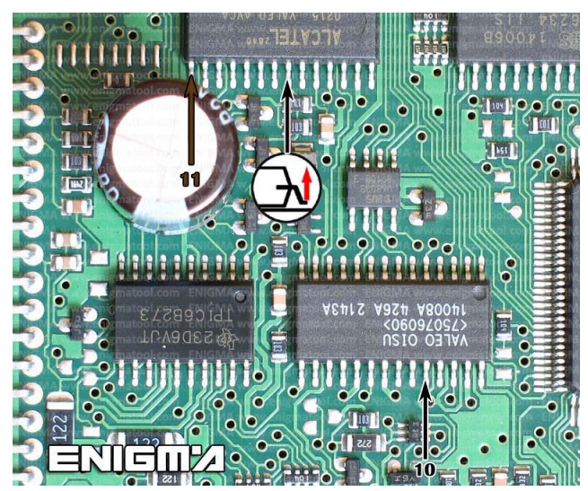
PHOTO 2: Solder C13 cables according to the colors like shown on the photos above. Remember to lift up one PIN like shown on photo above.