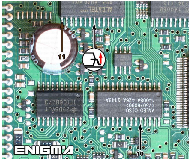
PHOTO 2: Solder C13 cables according to the colors like shown on the photos above. Remember to lift up one PIN like shown on photo above.