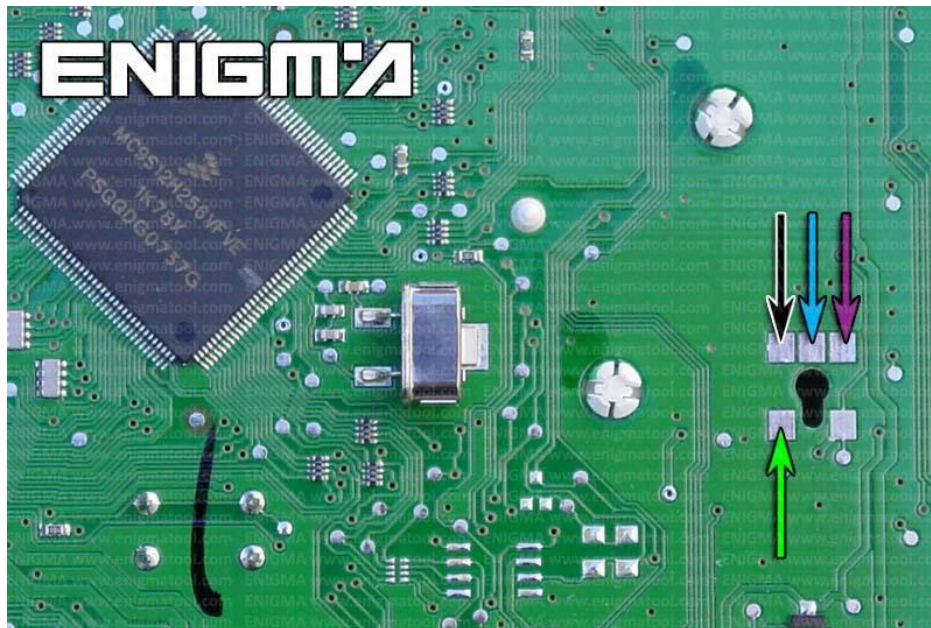
PHOTO 1: Solder C12 cables according to the colors like shown on the photos above.