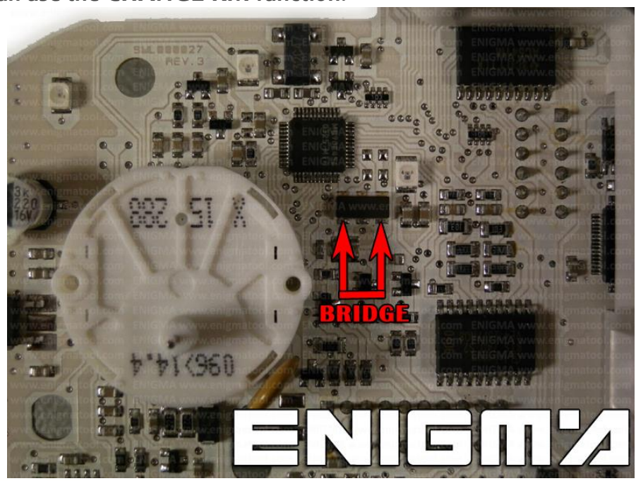
PHOTO 1: Make BRIDGE on processors quartz according to the picture above.