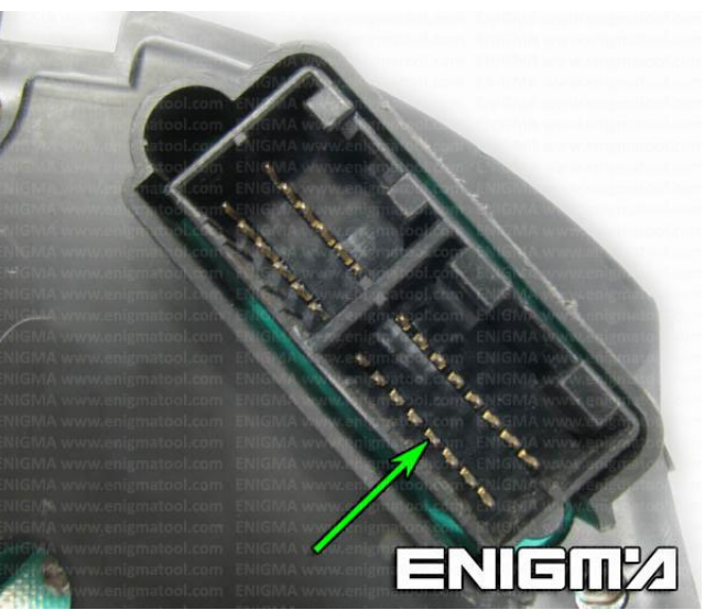
PHOTO 1: Connect cable C15 to the points as show on the picture above.