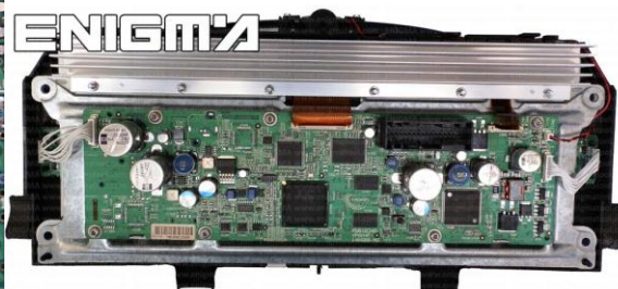
PHOTO 1: Connect cable C4 to the EEPROM memory according to the picture above.